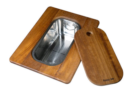
PLANCHE DE DECOUPE DOUBLE IROKO A644 F44